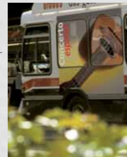
Above: SEFAR® Decoview affixed to the inside of window frontage provides a new advertising surface Left and below: SEFAR® Decoview in use on vehicles as a substrate for advertising, company logos, etc.

The substrate is adhesive from edge to edge. It is removable even after a long period in use, without damaging the surface below.