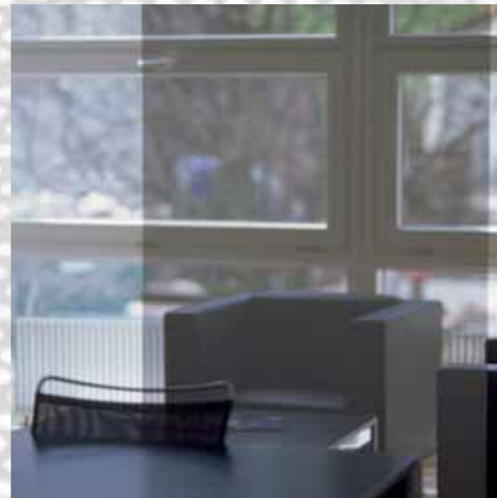
Above left: SEFAR® Decovision provides an elegant indoor screen. SEFAR® Decovision appears as a pale, transparent filter when viewed from the inside