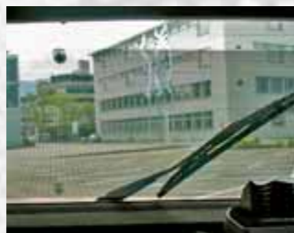
Above: SEFAR® Decovision non-adhesive substrate combined with a simple assembly element: For low-cost yet effective advertising, for example on vehicle rear windscreens

It attaches without adhesive, using an easy applicator system. Anyone can do it.